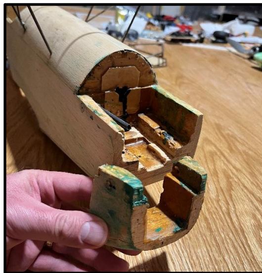
The 1.5" hunk of balsa removed from the nose

Now I was all set to get to work on repairing the broken parts and changing a few details to suit my preferences. This included removing the torque rods in favor of a servo on each aileron, shortening the nose back to the original length, and revising the wing mounting methods.