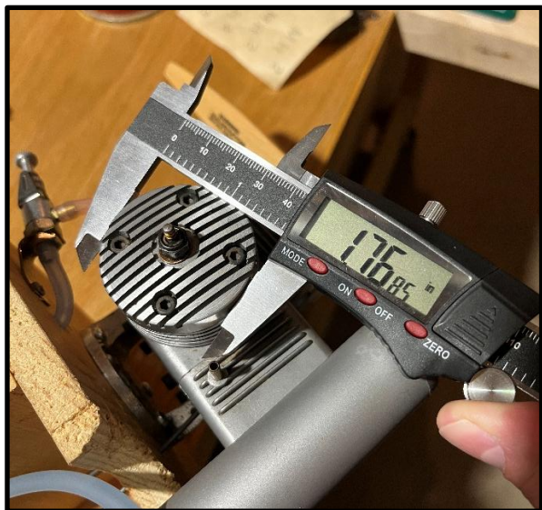
14 cooling fins and 1.77" diameter

number of cooling fins and diameter of the engine head with what was listed. The strange thing was that it appeared to be larger than my OS 50 I have for another project, so I hadn't been aware of the difference.