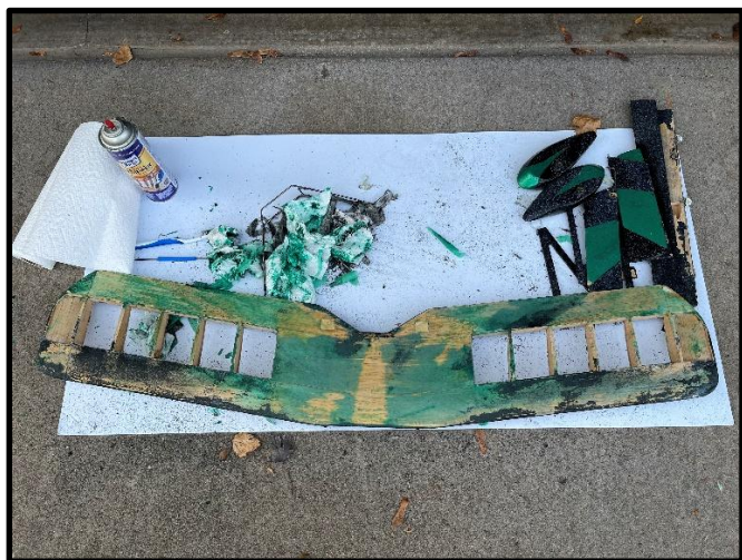
My attempt at stripping the upper wing

Some of you may know about the Aeromaster biplane that I acquired a while ago for the hard-to-pass price of $20. It was built decently well by its previous owner, but the Silkspan covering was already torn in a few places despite having never flown, and the paint was thick and runny. I was encouraged by another club member to put it higher on my list of planes to get to, so I spent some time removing the covering where I could. I tried to use paint stripper on the rest, but I'm not sure I was patient enough to let it work.