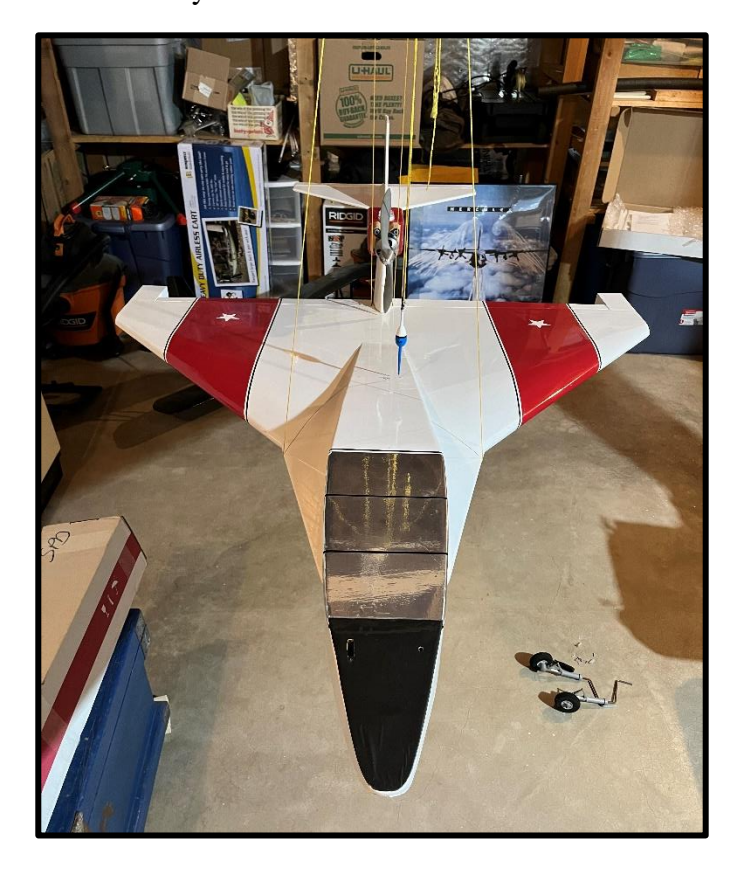
Using a Vanessa Rig to balance the Northstar

You can see that my Stinson takes up a whole corner of the basement with its wings on. I have no intentions of storing planes in my garage or attic, so I'm left with the decision to not acquire any more planes. Hopefully this will let me focus on the projects I already have and learn to be content. I think I've discovered over the course of this rambling article that it is important to not overwhelm myself with high expectations and to set limits on buying planes before it's too late. In my case it may already be too late because the stack of kits I have will inevitably expand to take up more space when I get around to building them. For now I plan to simply enjoy the building journey and be happy with what I already have.