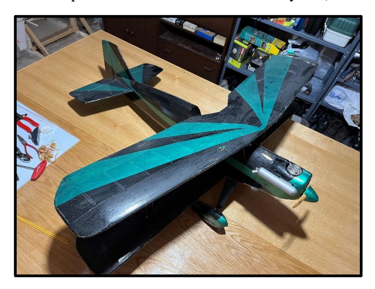
Aeromaster in need of some refurbishing

I'm prone to getting frustrated over my supposed inability to finish projects, but I know now that negativity like that is not productive or healthy for me. So, this year I'm trying something different and not committing to any particular prediction of what I'd like to complete. I'd rather commit to enjoying this hobby that we love and stop focusing on the end goal of finishing (and by the looks of my basement I doubt I'll be at the point of "finished" for decades anyhow).