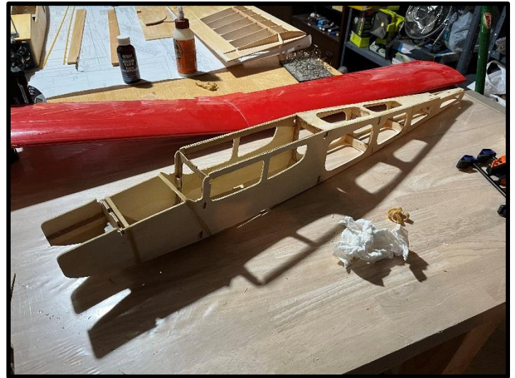
Fuselage and wing of the V-Eaglet