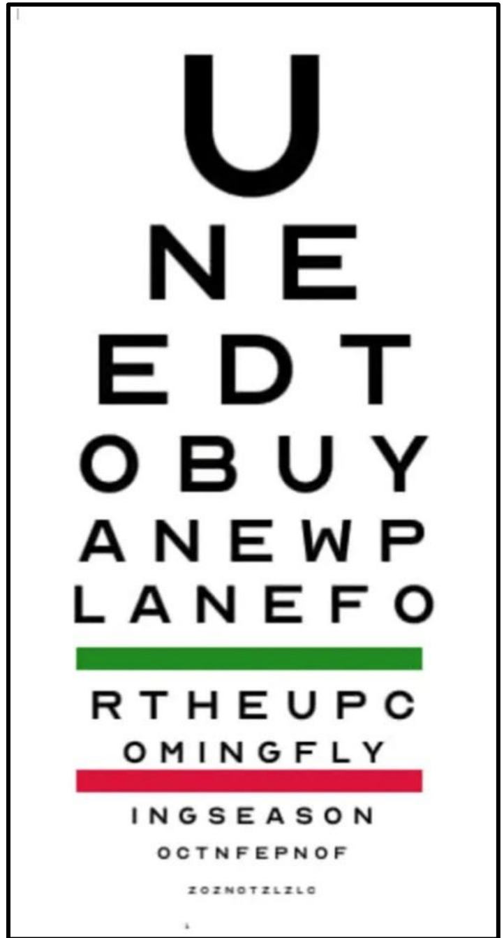
For those of us that need their eyes checked 😊