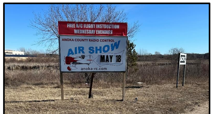
The NEW sign up along the highway