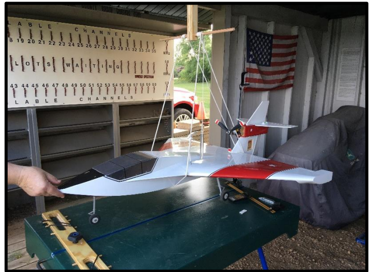
The Northstar getting its CG figured out