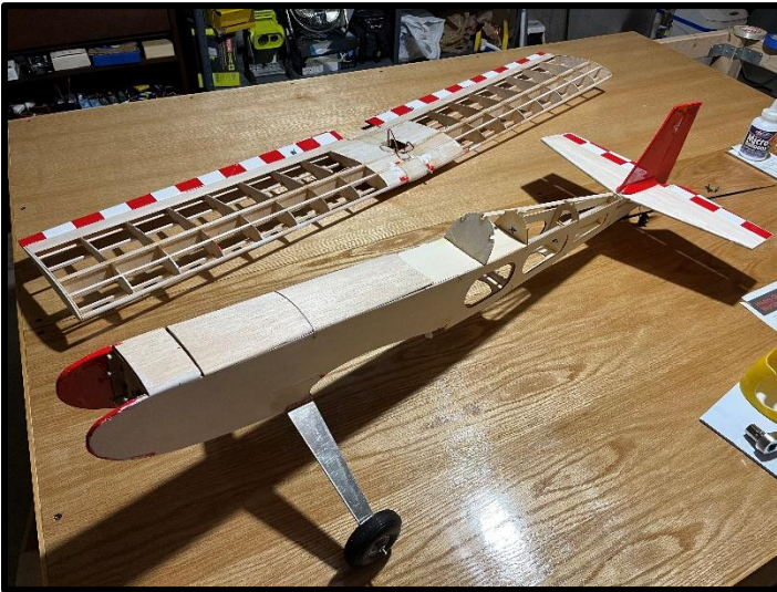
Ryan's Four-Star 40 (to be electric powered)