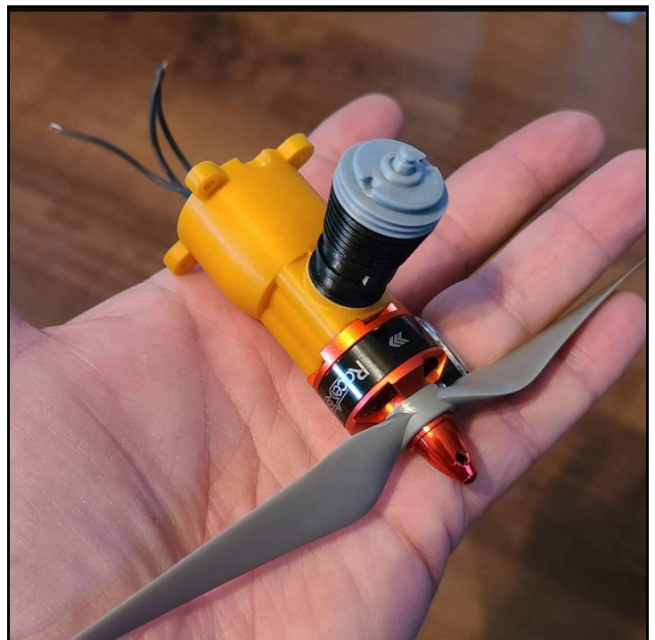
Electric TD .049