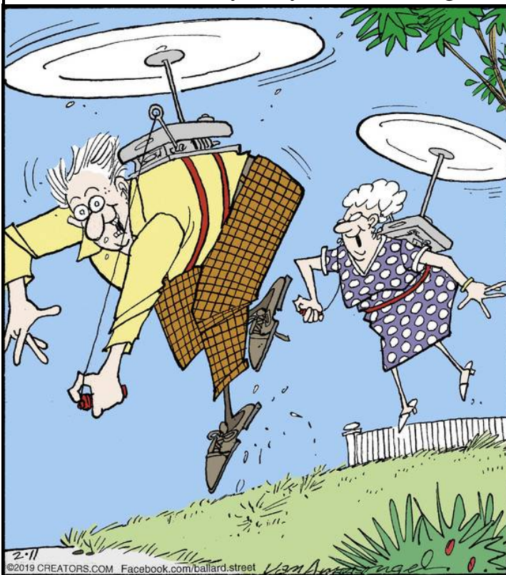
The Karashs are going to be a handful today.