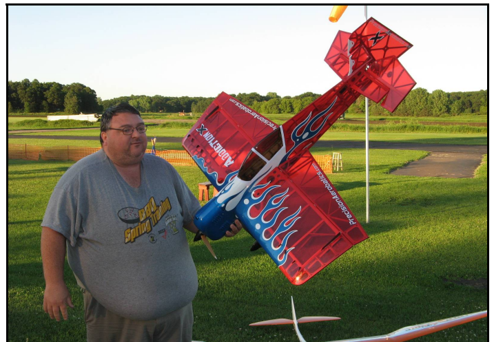
The second is a Preston Aerobatics Addiction. A semi profile fuselage with lots of carbon fiber results in 8 oz wing loading.